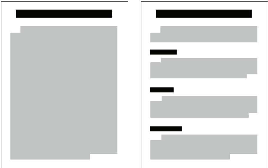
Fig 1. Our attention spans naturally dip in the middle of anything (watching TV, listening to the radio, reading) and our ability to recall information from the middle is significantly less. By ‘chunking’ information you are increasing the number of beginnings and ends, and the reader will be able to recall more of your paper 5 .